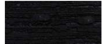
TIMBER Mono 110 Carbon 1.0%