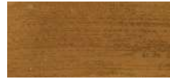
GROOVE Mono 103 Nature 1.0% Accent 110 Beut