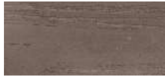
TIMBER Mono 120 Terra 1.0% Accent 110 Beut