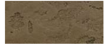
FOSIL Mono 111 Celadon 1.0% Accent 110 Beut