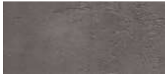
REGULAR Mono 107 Concrete 1.0% Accent 110 Beut