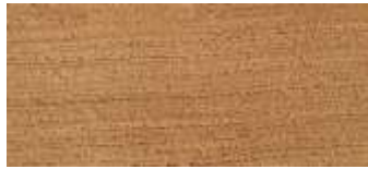
GROOVE Mono 119 Terra 1.0% Accent 112 Panna