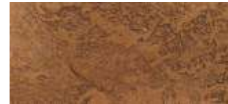
FOSIL Mono 111 Nature 1.0% Accent 110 Beut | 110 Panna