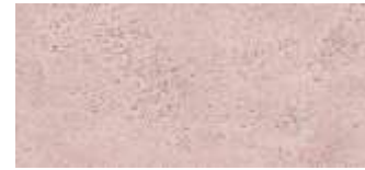
REGULAR Mono 105 Nature Accent 103 Wroons