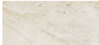
FOSIL Mono 111 Ivory 1.0% Accent 110 Beut | 110 Panna | 110 Terra