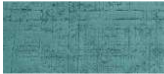
GROOVE Mono 122 Jade 7.0% Accent 110 Beut