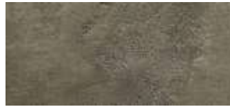
REGULAR Mono 111 Celadon 1.0% Accent 110 Beut